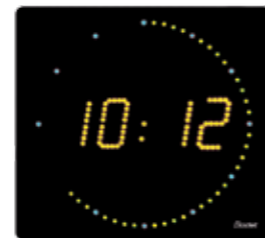
STYLE 7 ELLIPSE

Fixed display: hour - minute - second (second is displayed on the ellipse).