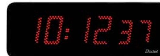
STYLE 12 S

Alternating display: time and temperature, fixed temperature or fixed time.