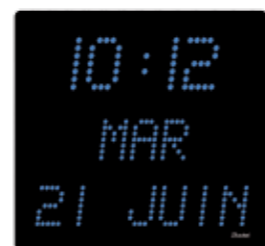
STYLE 7 DATE

Alternating display: date or week number.